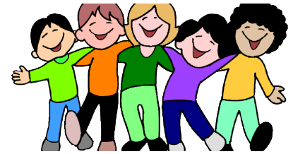
Kids in grades K-5 growing with Jesus